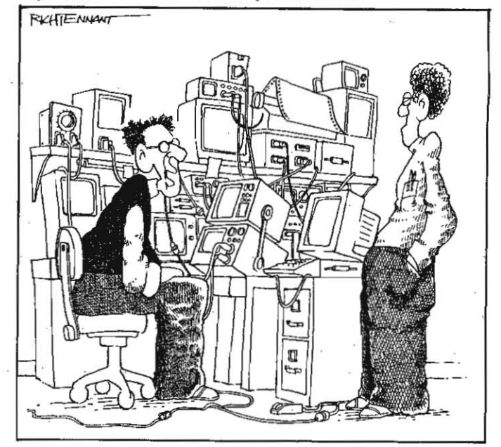
" RIGHT NOW I'M KEEPING A LOW PROFILE, LAST NIGHT I CRANKED IT ALL UP AND BLEW OUT THREE BLOCKS OF STREET HIGHTS."

SoftSwitch also has a provision for cutting and pasting any single- or double-resolution graphic image from one program to another. It doesn't matter whether one of the programs is protected or whether the programs run under different operating systems. All that's necessary is that the programs use standard Apple graphics and that they allow access to the desk accessory menu. Thus, if one of your workspaces holds a graphic printing program such as Beagle Bros Triple Dump or Roger Wagner's own Printographer , you can capture a high-res image from almost any program at any time and print it. SoftSwitch can also save text displays — thus providing a way to take "screen shots" for use in printed material.